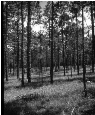
Stand properly thinned