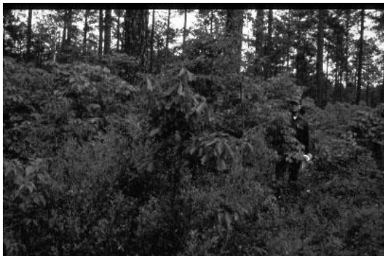
Dense hardened understory.