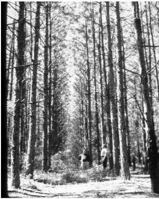
Over stocked plantation in need of thinning